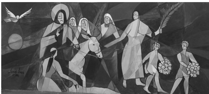
Domingo de Ramos de la Pasión del Señor, Año B.

La Humanidad Doliente - ¡Qué bien se identifica Cristo con el sufrimiento de nuestro pueblo! Así parecen clamar muchas cosas, muchos tugurios, muchos en las cárceles y en el sufrimiento, muchos hambrientos de justicia y de paz. "¿Dios mío, Dios mío, ¿por qué me has abandonado?" No nos ha abandonado. Es la hora en que el Hijo de Dios va pasando con toda su carga de pecado por la obediencia que Dios le pide para poder perdonar esos pecados de la humanidad de donde derivan todas las injusticias, todos los egoísmos.